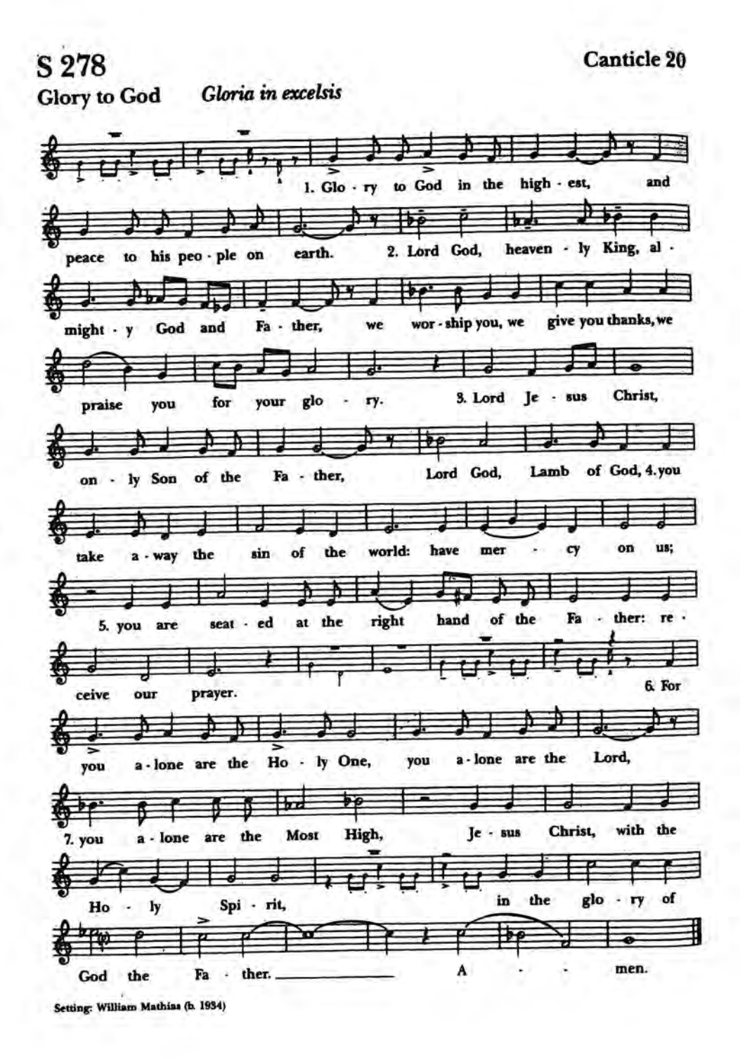
The Hymnal 1982, Copyright © 1985 by The Church Pension Fund. Used by permission. OneLicense # A-724223. All rights reserved.