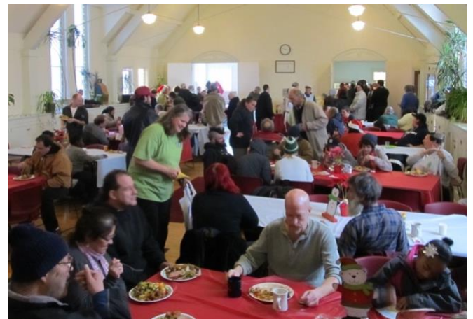
Click/tap photo for larger version