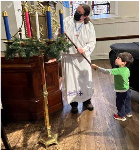
Click/tap photo for larger version

Parishioners at St. John's reflect the rich diversity of the Ithaca and Tompkins County communities. Specifically, this includes cultural, ethnic, racial, gender, physical, and developmental abilities, and members of the LGBTQIA+ community. St. John's welcomes and embraces this diversity in various thoughtful and intentional ways. We are blessed with a unique mix of parishioners, including undergraduate and graduate students from the colleges and universities in our community. We thank God for blessing us with such a variety of experiences and perspectives to address the diverse needs of our community.