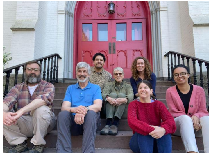
St. John's search committee members.

The 2024 Rector Search Survey (click/tap the link for a summary of the results) covered a few main areas: what parishioners value most in St. John's, the most important aspects of worship, what parishioners hope the future rector will bring as a leader and what their focus will become. The survey was primarily collected online. Paper surveys were also made available, and parishioners were invited to share feedback with search committee members during informal listen-and-learn sessions after the Sunday services. The survey was available for just over two weeks and received 53 responses. Committee members also interviewed several Loaves and Fishes staff and clients to get their perspectives.