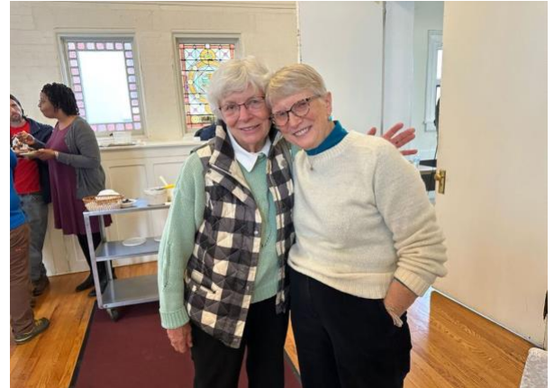
Click/tap photo for larger version

We give thanks that our well-built and much-loved church facility stands on a firm foundation. The church facility includes a large